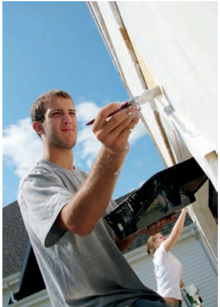
Students take part in a community service project during Fall Orientation.