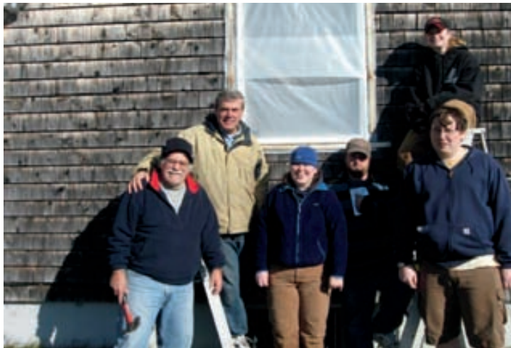
Above and below: Students in the Environmental Recreation and Tourism Management program help winterize homes for the elderly through the Keep ME Warm project.