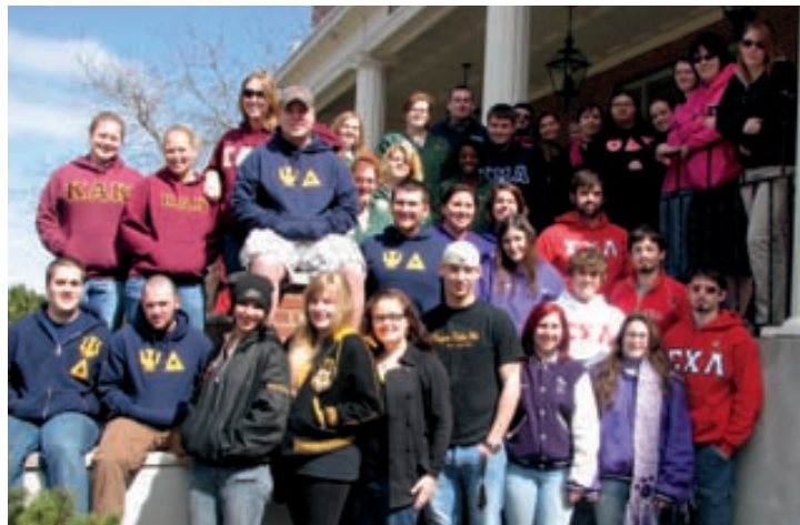
Members of UMM's Greek organizations gathered for a photo this spring. They represent nine sororities and fraternities on campus.